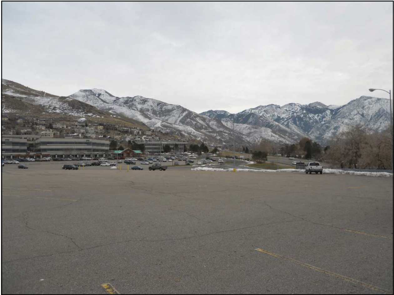
West side of existing building