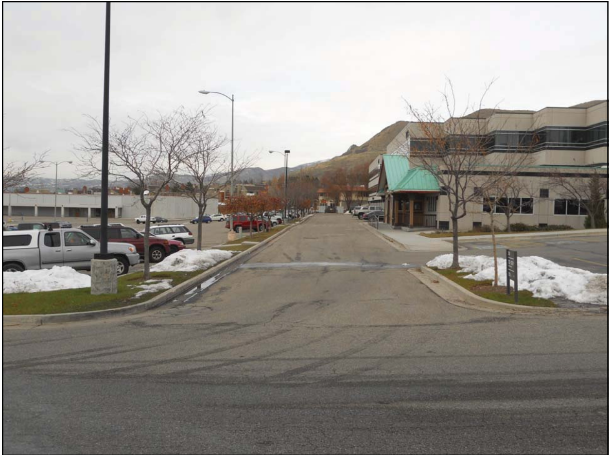
Commercial buildings east of subject property